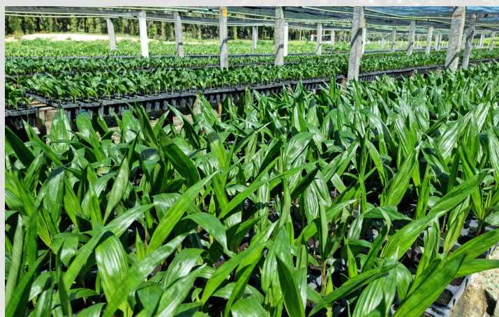
Healthy oil palm seedling in Hyplug 24 with Base 15-11-11+1.5MgO in pre-nursery.