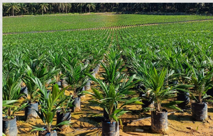
Oil Palm Seedling in main nursery with Ekot 15-8-12+2MgO .