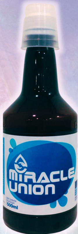
Miracle Union with "4 in 1 functions"

Additionally, it also has special properties of drift control by reducing the number of fine particles created during spray applications.