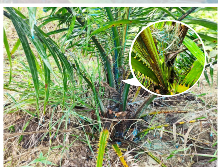
Control spraying extended to 3 weeks interval compared application without any adjuvant.

Spraying with Miracle Union helps to develop a concentrated solution layer on the target surface which repels pests from attacking the new fronds and extending the spraying interval.